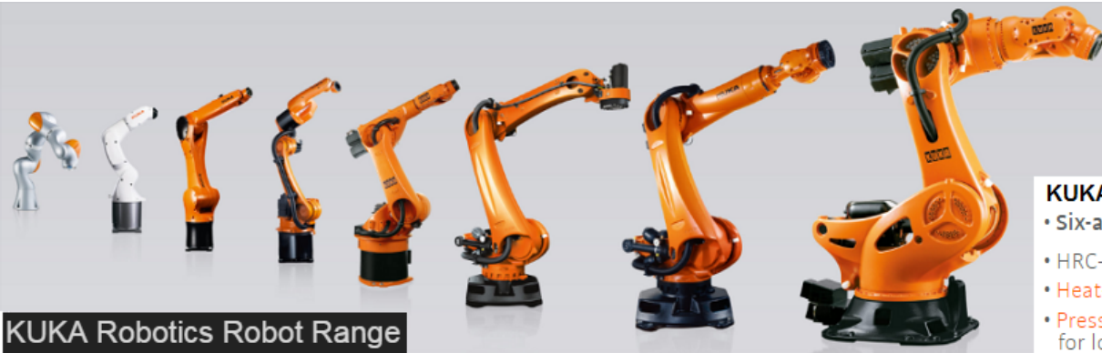
KUKA Robotics Robot Range