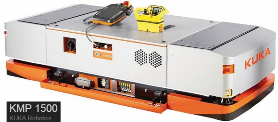
KMP 1500 KUKA Robotics