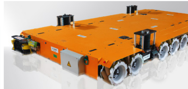
KUKA omniMove KUKA Robotics