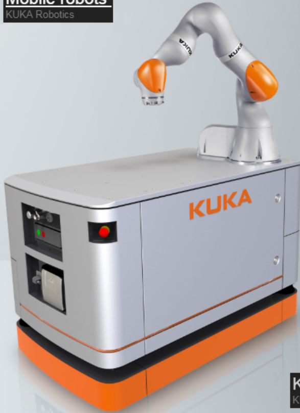
KMR iiwa KUKA Robotics